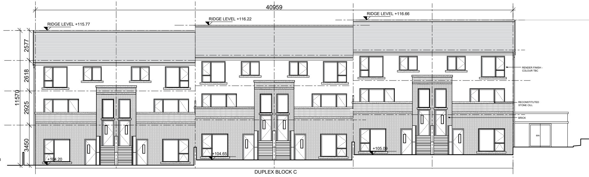
3 West Facing Elevation 0457